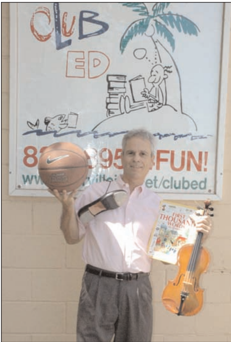
Community Education is part of all our daily lives! Is it part of yours?